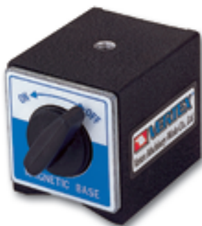
ORDER NO. VMB-00 MAGNETIC BASE ONLY M8X1.25p,80kgs