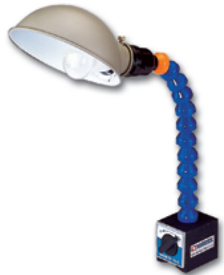
ORDER NO. VML-B UNIVERSAL MAGNETIC WORKING LIGHT