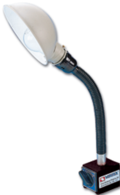
ORDER NO. VML-A MAGNETIC BASE AND WORKING LIGHT