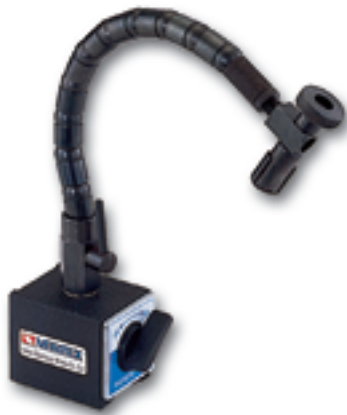
ORDER NO. VMB-06 FLEXIBLE ARM WITH MAGNETEC BASE