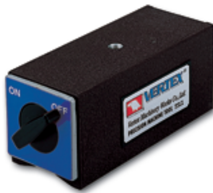
ORDER NO. VMB-11 MAGNETIC BASE ONLY M8X1.25p,140kgs