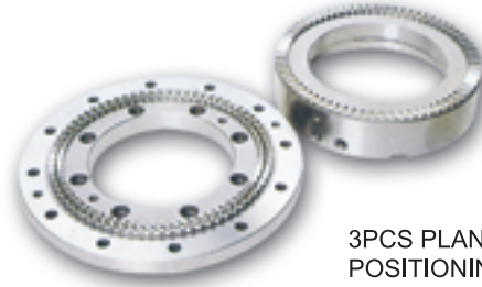
3PCS PLANE GEAR PLATE POSITIONING FOR SUPER HYDRAULIC FEED INDEXER